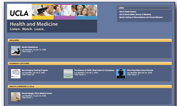
Welcome Page and Sections