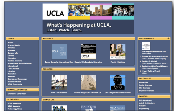
UCLA on iTunes U Main Page

“ Podcast track ” is one of a series of audio or video files associated with a single podcast series.